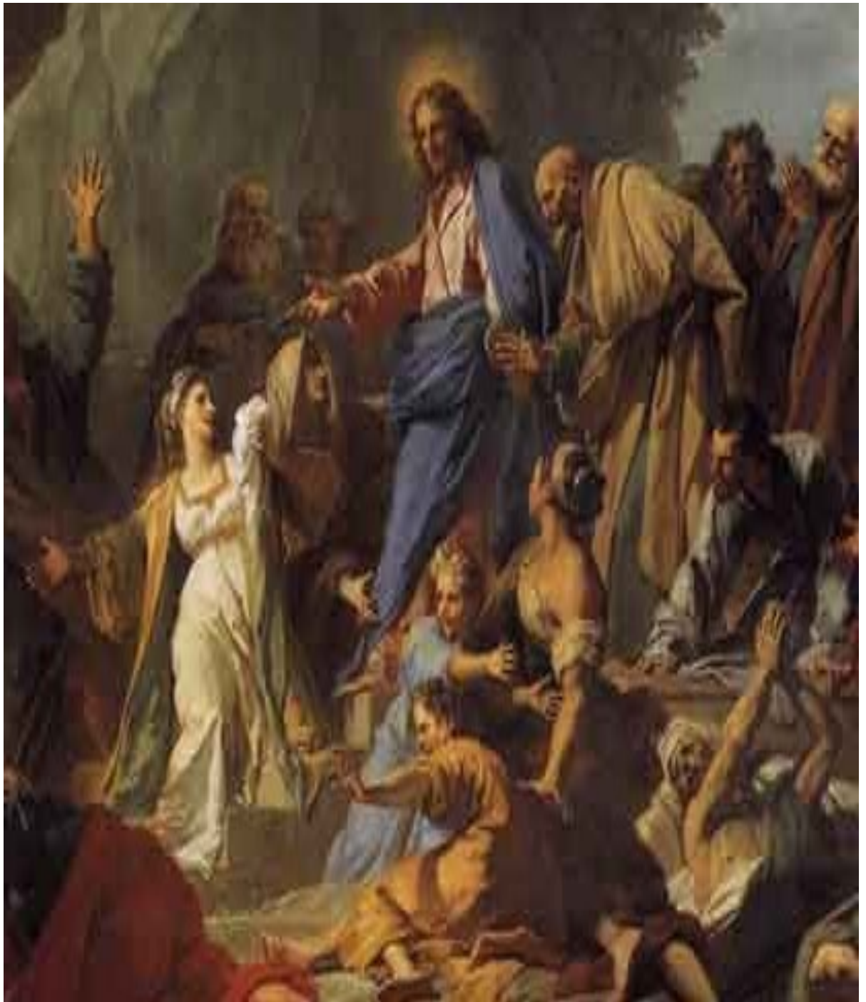
Fifth Sunday in Lent